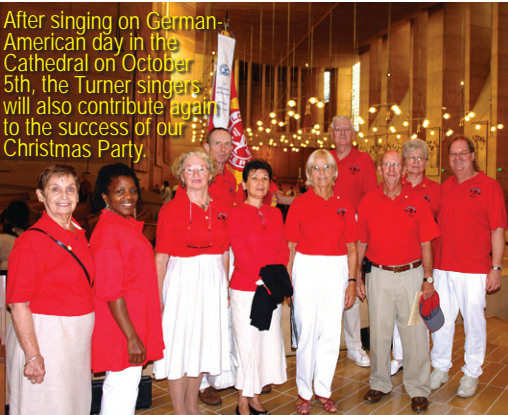
After singing on German-American day in the Cathedral on October 5th, the Turner singers will also contribute again to the success of our Christmas Party.