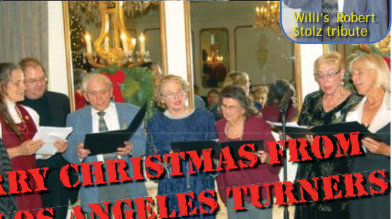
The Turner Singers led the Christmas Carols