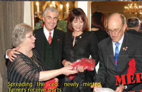
Spreading the red: newly minted Turners receive shirts