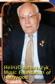
Heinz Dobroszyk Music Foundation of Hollywood